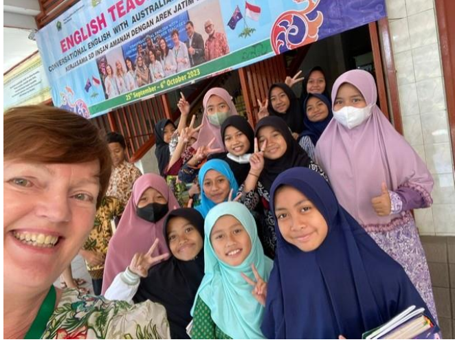
Students from SD Insan Amanah

During the last school holidays, I had the opportunity to travel to Malang in East Java with other teachers from WA to teach English. It was an amazing, enriching, intense and rewarding two weeks. It was part of a pilot program organised by Arek Jatim WA to enhance relationships between WA and East Java. Five primary school teachers worked across two schools focusing on conversational English. We were made to feel very welcome and I had the opportunity to use Indonesian and develop my cultural understanding. We enjoyed all the delicious food and sightseeing around Malang. The highlight was travelling to Mount Bromo to see the sunrise and then climbing and walking around the crater. I am excited to share my new knowledge and experiences with my students.