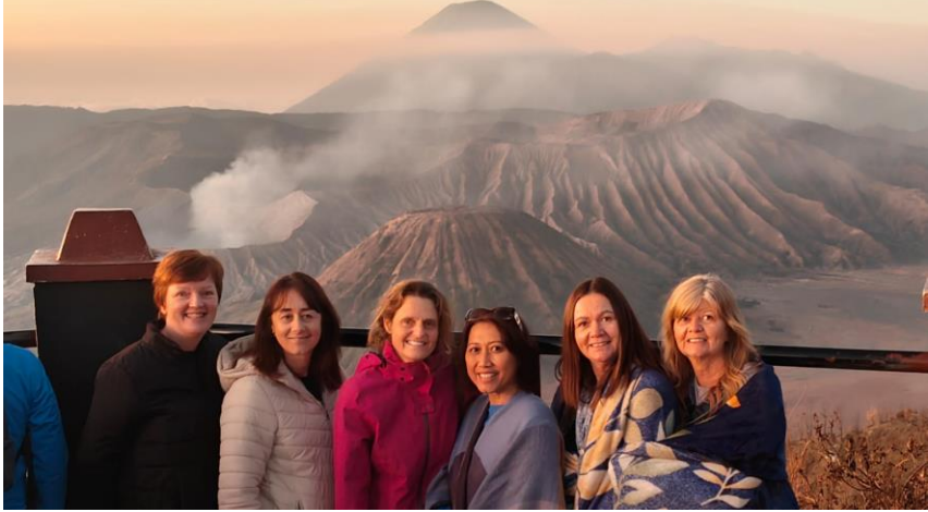
Mount Bromo at sunrise