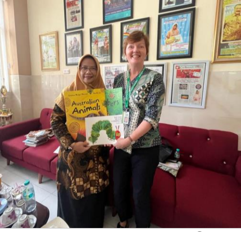
Books donated by BPPS