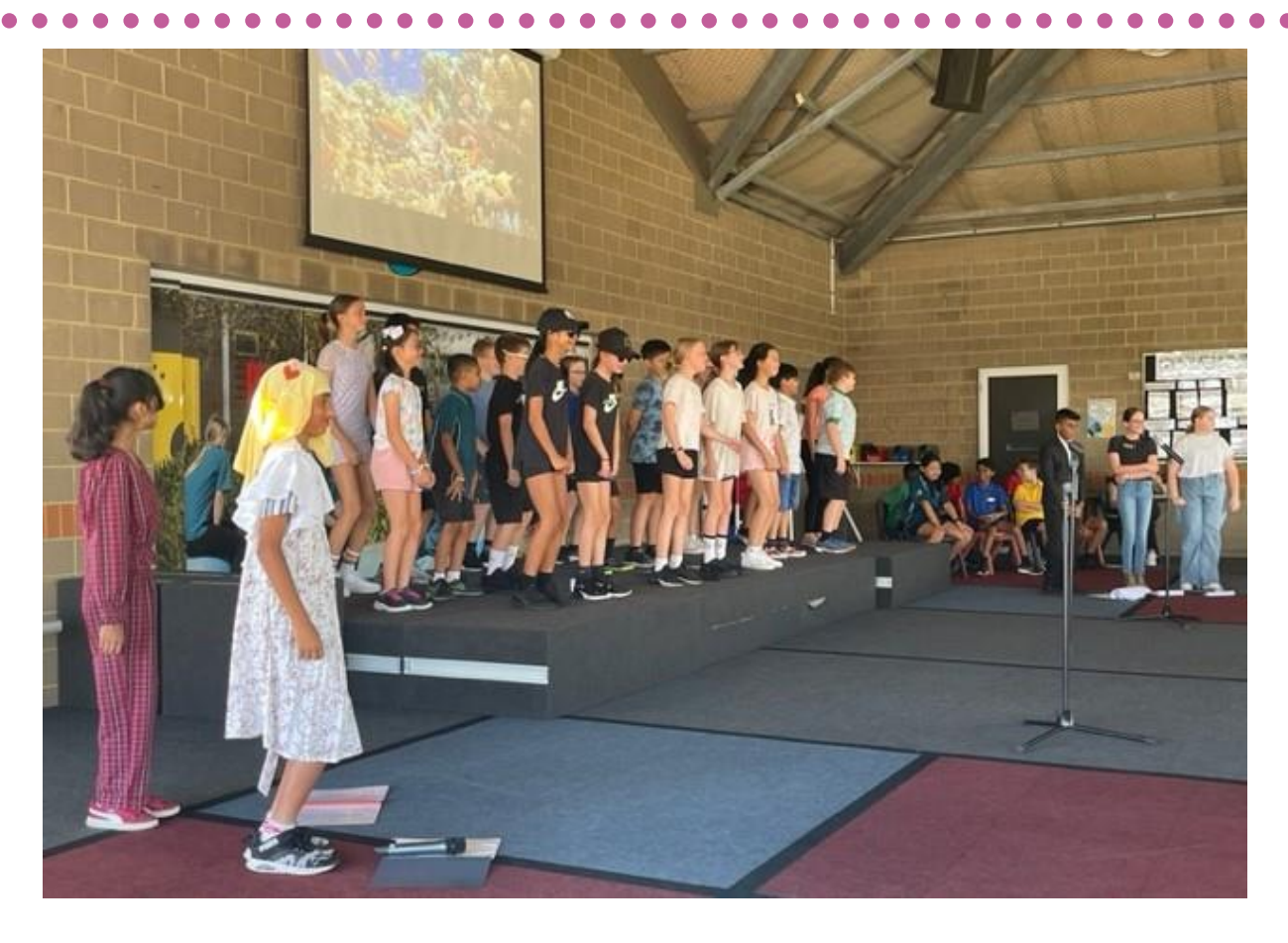
LA 27 Senior Assembly