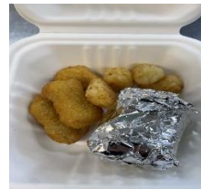
Chicken Nugget Box

Hot Chocolate is now available at morning recess at $2 a cup, order online or buy at the canteen in the morning recess