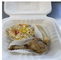
Mini Asian Bento