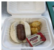
Mini Hot Dog Box

We have selected options available to our Kindy & Pre-primary students, and you may also order from the main menu.