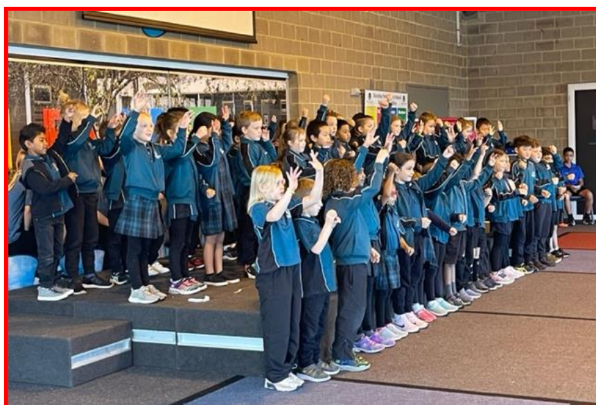
Be, Think, Grow Awards Date: 17 th June 2022

The Year Ones in LA 1 and 2 hosted the assembly on Friday 17 th June. The Year One students took turns in sharing interesting facts they had learnt about famous inventions and inventors. The students spoke clearly and confidently in front of an interested audience of students and their parents. At the end of the assembly the students followed their sensei (their teachers) and gave us a vigorous demonstration of Kung Fu Punctuation, where they acted out the different punctuation marks with cool Kung Fu moves.